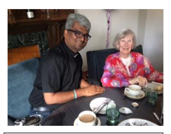
Members of the Church spent time with

We have also received a Thank You letter from Lebone Village this week, thanking us for our recent donation. I have attached the letter to the notices and here is a picture of the children they sent.